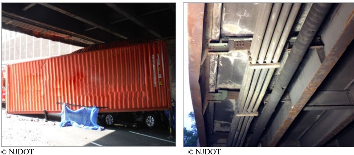
Figure 13. Photos. NJDOT Examples of Superstructure Damage Due to Truck Impact.

construction of the temporary and permanent repairs can be performed by in-house maintenance staff, existing force-account maintenance contracts or emergency on-call contracts. Examples of superstructure damage due to truck impact as reported by NJDOT are shown in Figure 13.