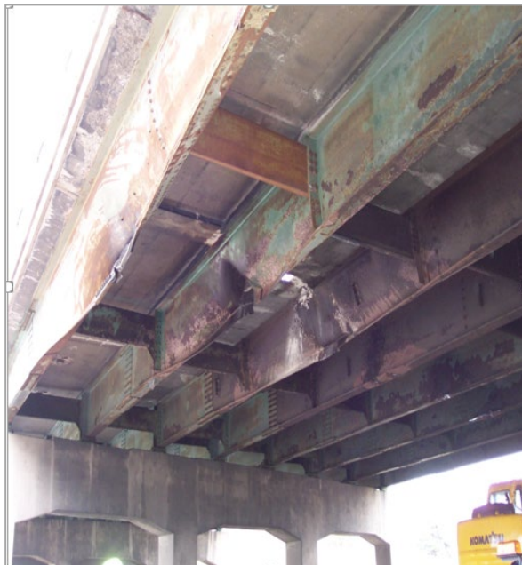
Figure 8. Photo. MnDOT Example of Column Damage Due to Truck Impact.